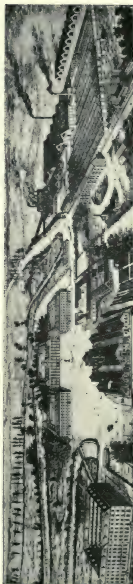
A BIRD'S EYE VIEW.